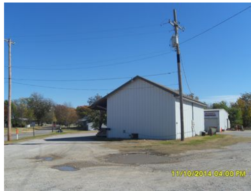
Front view from Main Street

LOTS OF POTENTIAL IN THE NEWLY REVITALIZED DOWNTOWN!