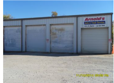
Shop with 3-10'X12' and 2-10'X10' overhead doors and 2 walk-in doors

LOTS OF POTENTIAL IN THE NEWLY REVITALIZED DOWNTOWN!