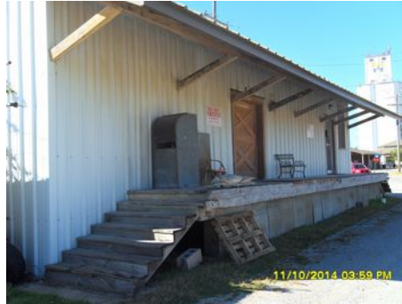
Old train depot. 13' walk in door and 1 6'6"X5' sliding door